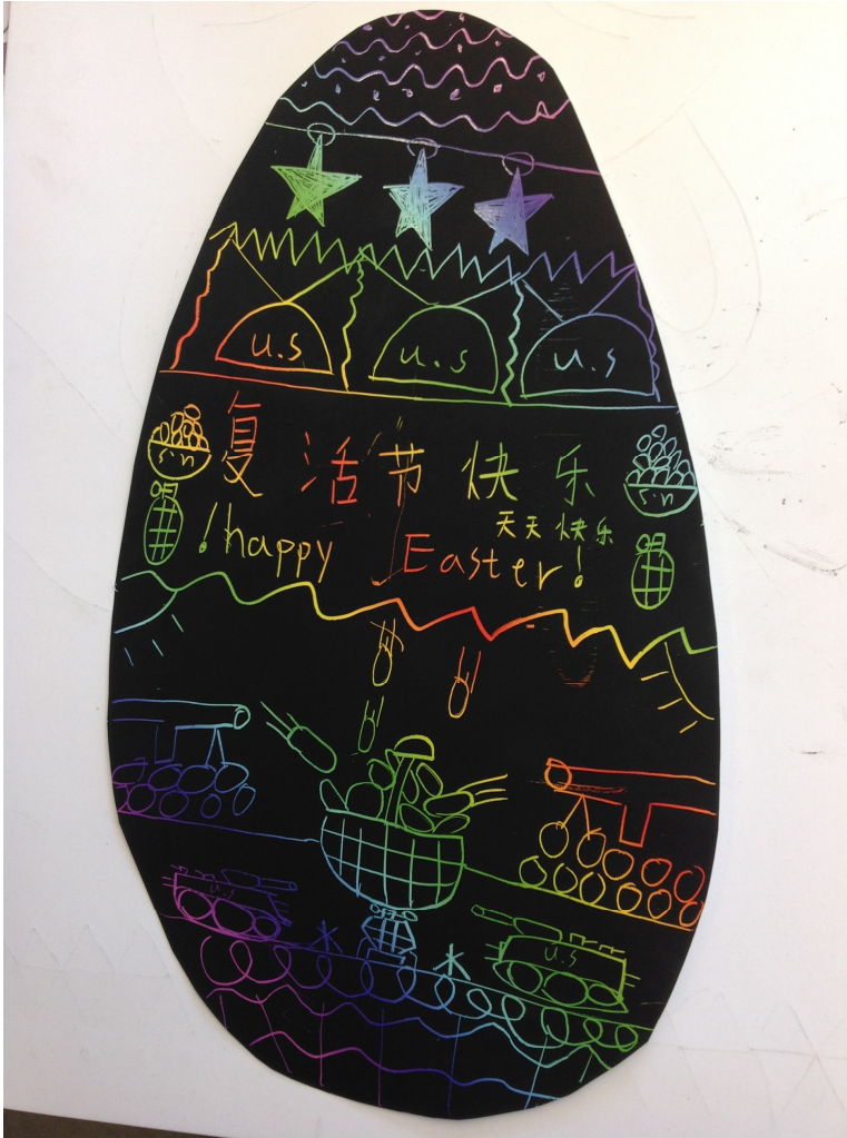
Artist: Nathan 4J, 'Happy Easter' scratch art, Art Club